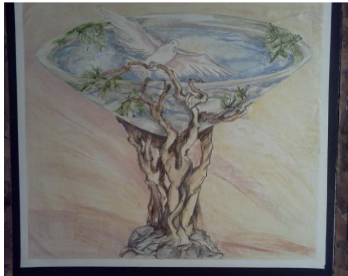
Living Water Baptismal Font

Please take advantage of all the front row seats if you are hard of hearing, have a walker or cane. It is so easy to get to Communion from there! You never know when there might a prize under your seat!