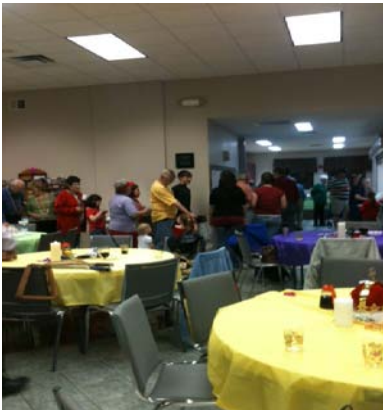
Check out the long line!