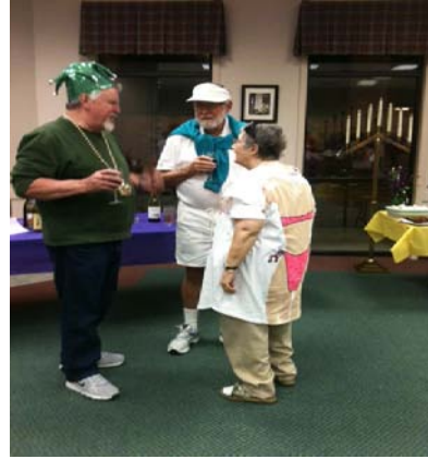
The Joker and the Beach Group