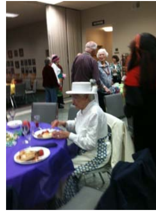
A very proper Lady